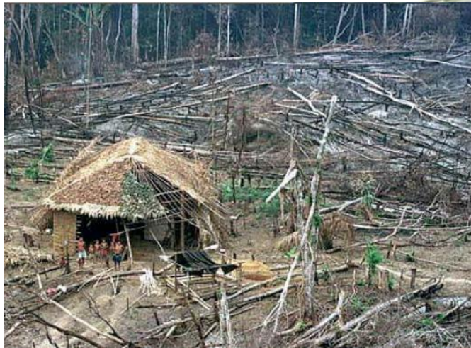
Fires: even man loses his basic existence

Man is pushing the forest back in favour of agriculture and livestock farming. In Asia and Africa, for example, palm oil is cultivated in former forest areas, and in South America cereals are grown for biofuels. In many countries, trees have to make way for mines.