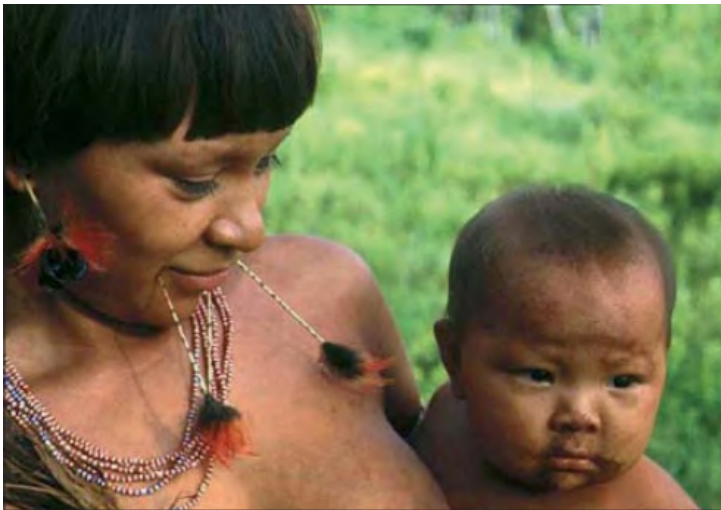
With FSC® you protect the habitat of forest dwellers